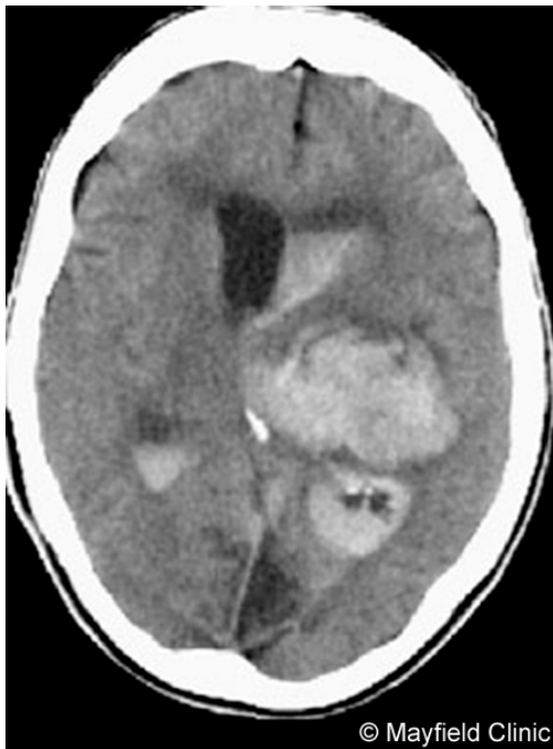
Figure 2. CT scan showing a large ICH.

Computed Tomography (CT) scan is a noninvasive X-ray to review the anatomical structures within the brain to see if there is any blood in the brain (Fig. 2). A newer technology called CT angiography involves the injection of contrast into the blood stream to view arteries of the brain.