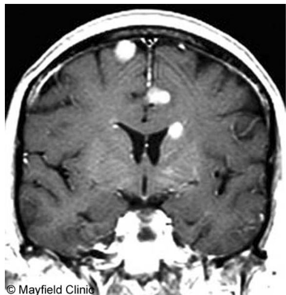
Figure 1. Illustration (top) and MRI (bottom) of multiple metastatic brain tumors that have spread from the melanoma skin cancer on the face.