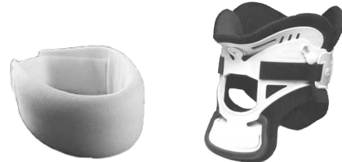
Soft cervical collar

Rigid braces are made from molded plastic with a removable padded liner in two pieces—a front and back piece—fastened with Velcro. This brace is used to restrict neck movement during recovery from a fracture or surgery (e.g., fusion). Common rigid braces are the Philadelphia collar and the Miami J collar.